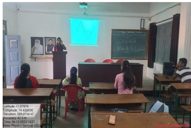
Students discussing about seminar topics